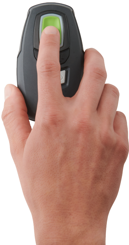
Inspire Sleep Remote

Inspire works inside your body while you sleep. It's a small device placed during a same-day, outpatient procedure. When you're ready for bed, simply click the remote to turn Inspire on. While you sleep, Inspire opens your airway, allowing you to breathe normally and sleep peacefully.