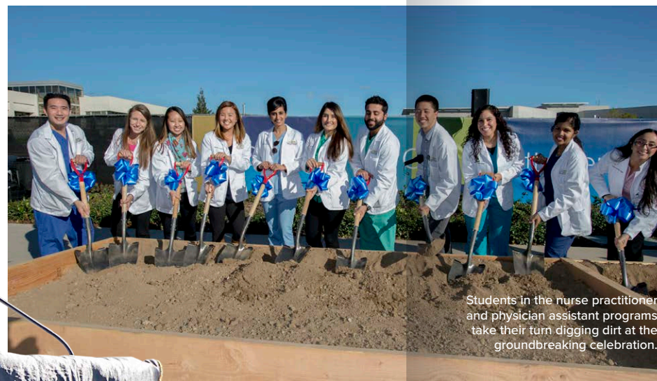
Students in the nurse practitioner and physician assistant programs take their turn digging dirt at the groundbreaking celebration.