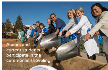
Alumni and current students participate in the ceremonial shoveling.