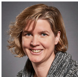
Pip Beard Pirbright Institute, UK