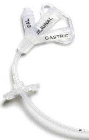
Image of Enteral Gastrojejunal Mic Tube 16 fr Non Enfit

The corresponding DME order set for this tube is: GJ Feeds- Choose Tube Type: Enteral Gastrojejunal AMT Micro G Jet