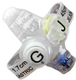
Image of the AMT Micro G Jet

The corresponding DME order set for this tube is: GJ Feeds- Choose Tube Type: Enteral Gastrojejunal AMT Micro G Jet