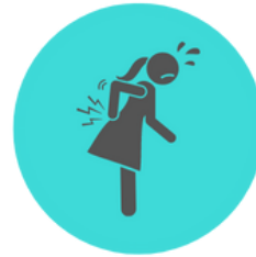
persistent back pain