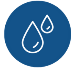
abnormal vaginal discharge

Early detection saves lives! Get screened TODAY!