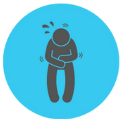
persistent pelvic pain