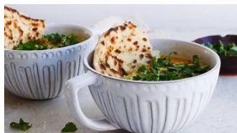
Coconut Sweet Potato Lentil Soup with Rice.

On another note, I would like to share one of my new favorite recipes with you all! With the cold weather recently, I have been trying out different soups and one of my favorites that I recently found was a coconut sweet potato lentil soup with rice. It is simple to make and delicious with some Naan on the side!